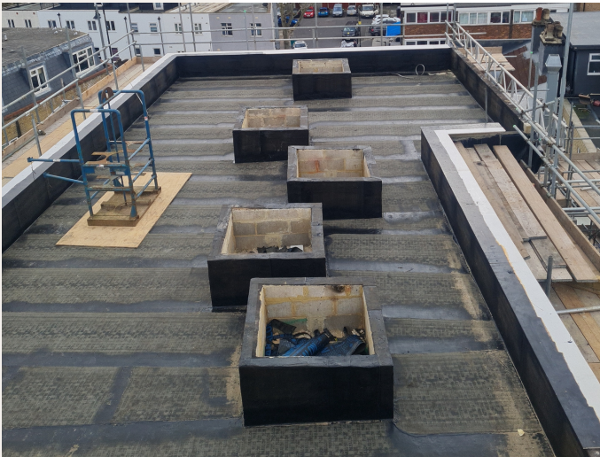
Roof Water proofing