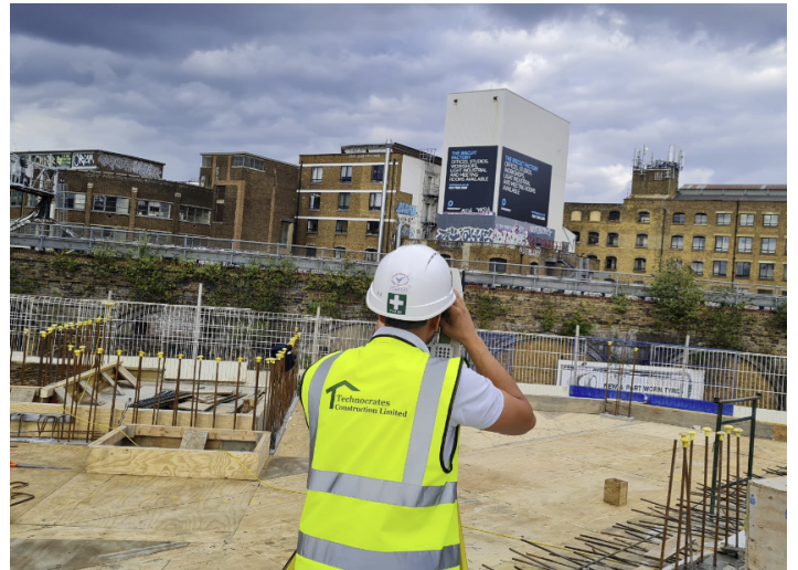
Rebars for Intermediate floor