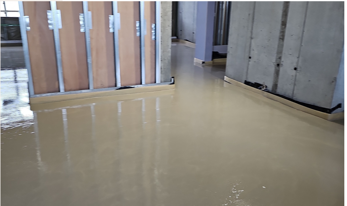
Liquid Screed to Intermediate Floor