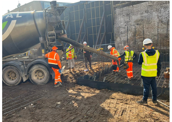
Concreting Pouring Crane Base