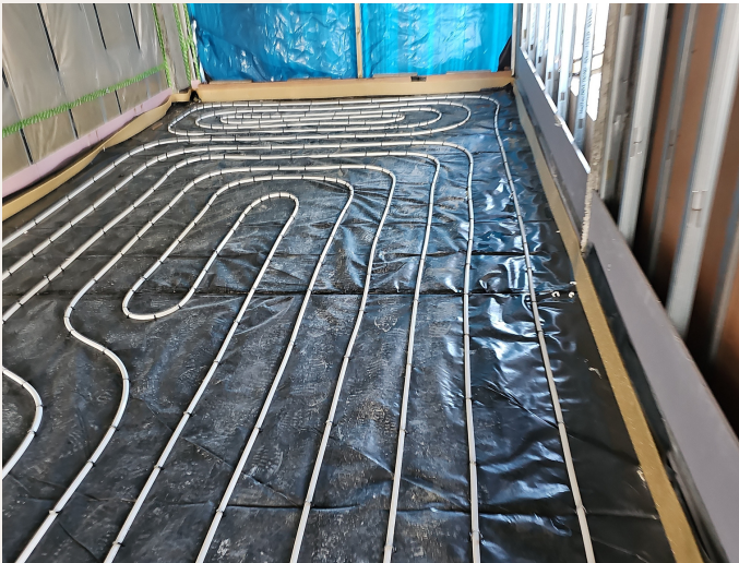
Under Floor Heating