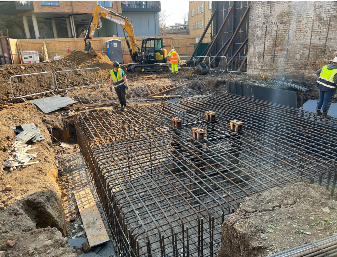
Crane Base Rebars