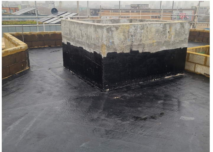
Roof Water proofing