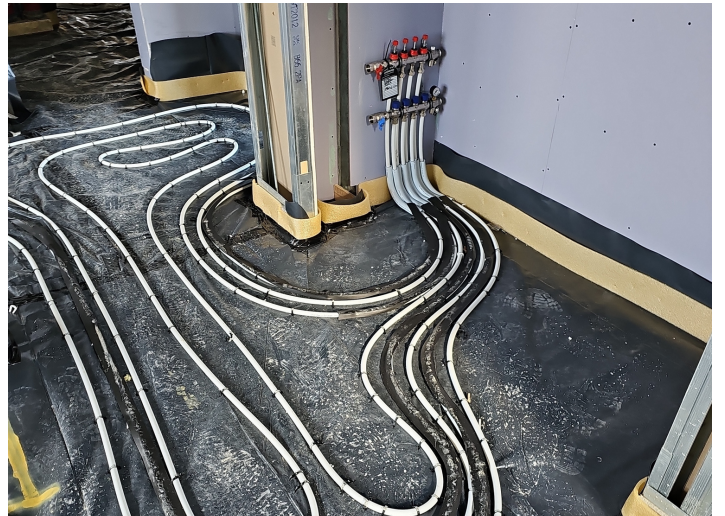
Under Floor Heating