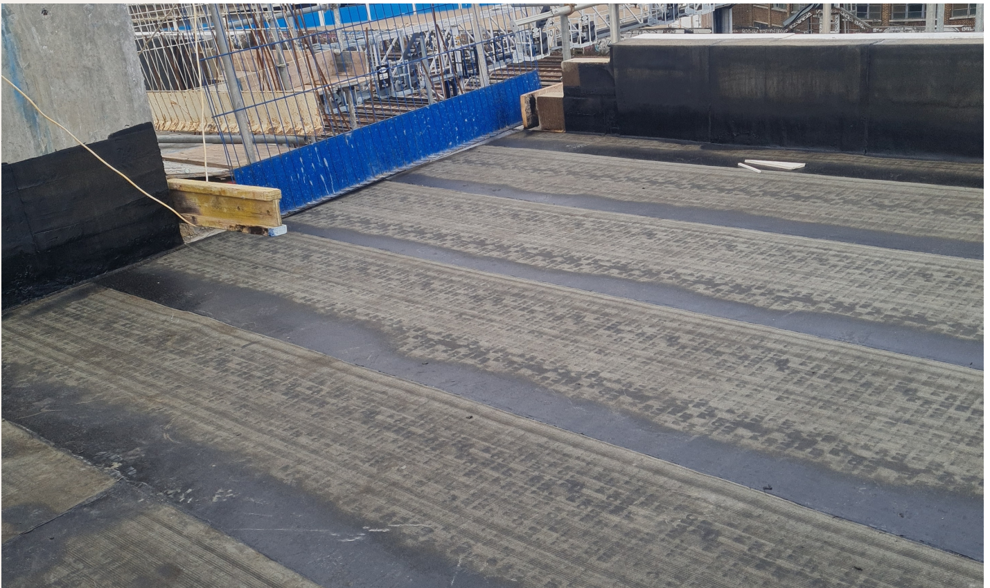
Roof Water proofing