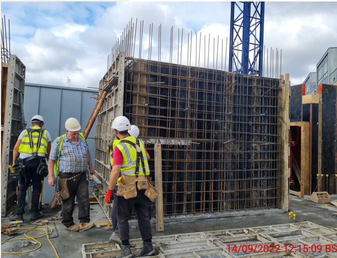
Rebars for Verticals