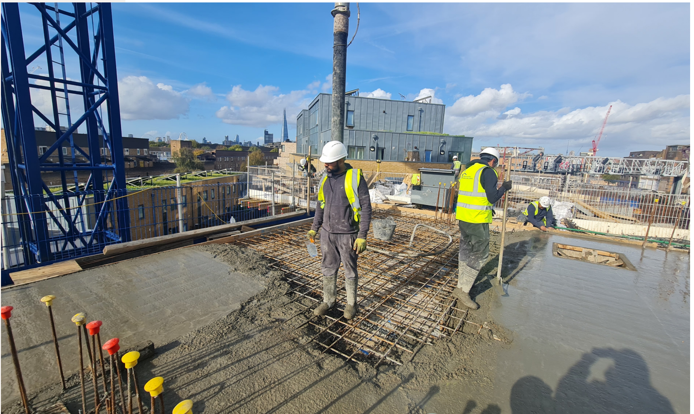
Concrete for Intermediate Floors