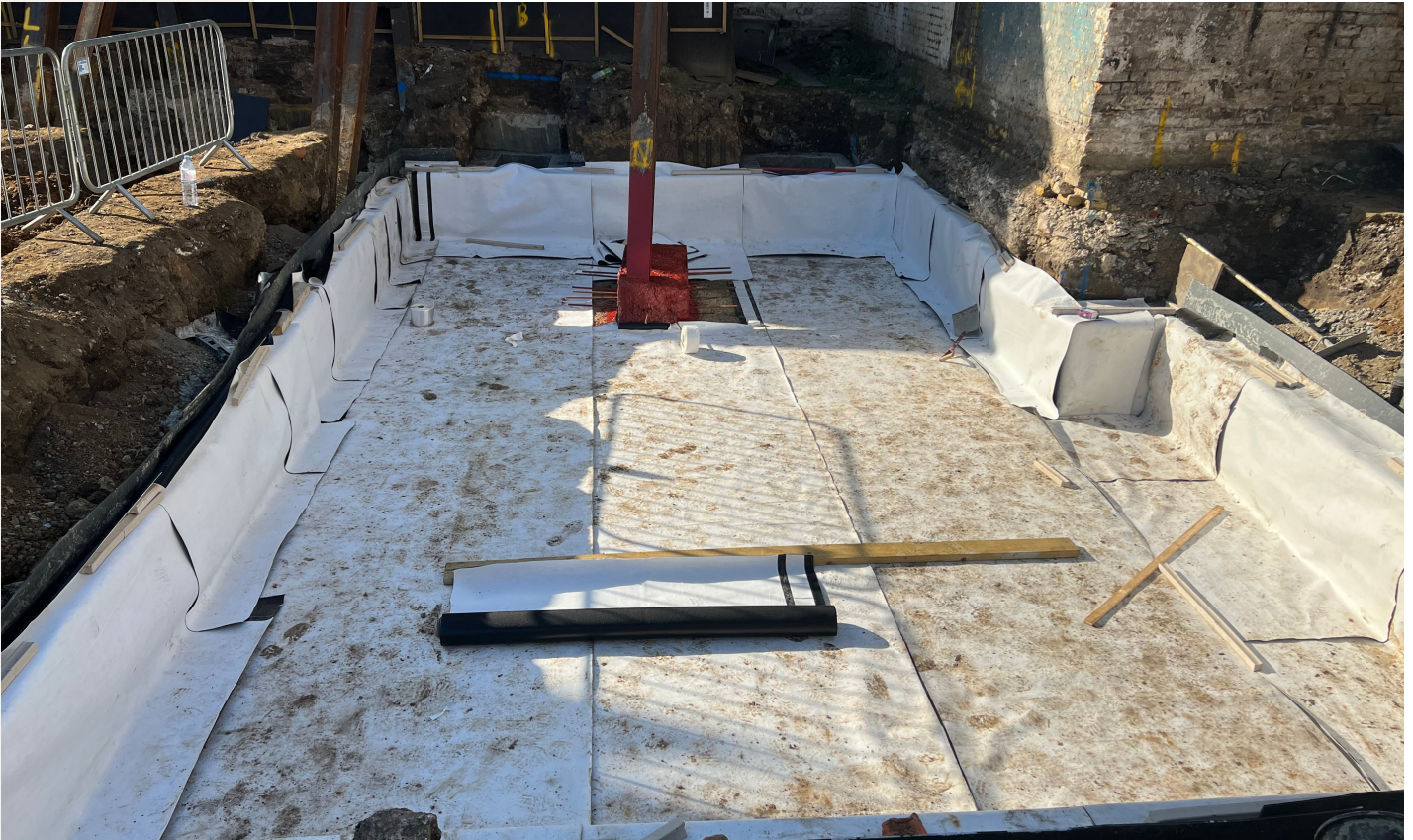
Installation of Gas Membrane