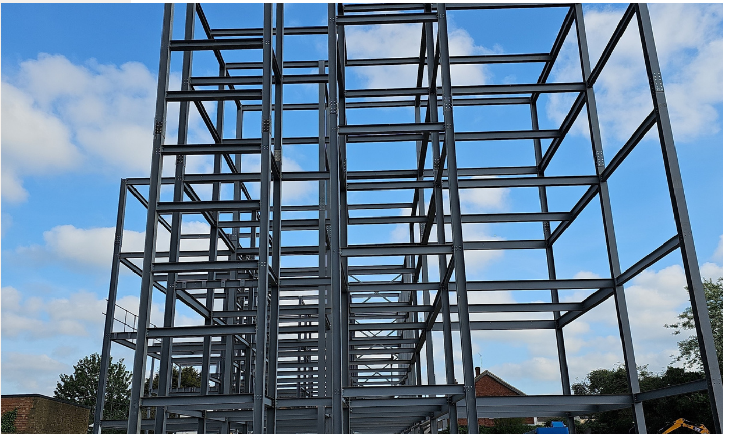
Structural Steel Works