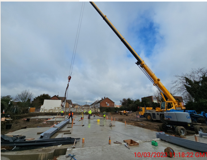
Structural Steel Works