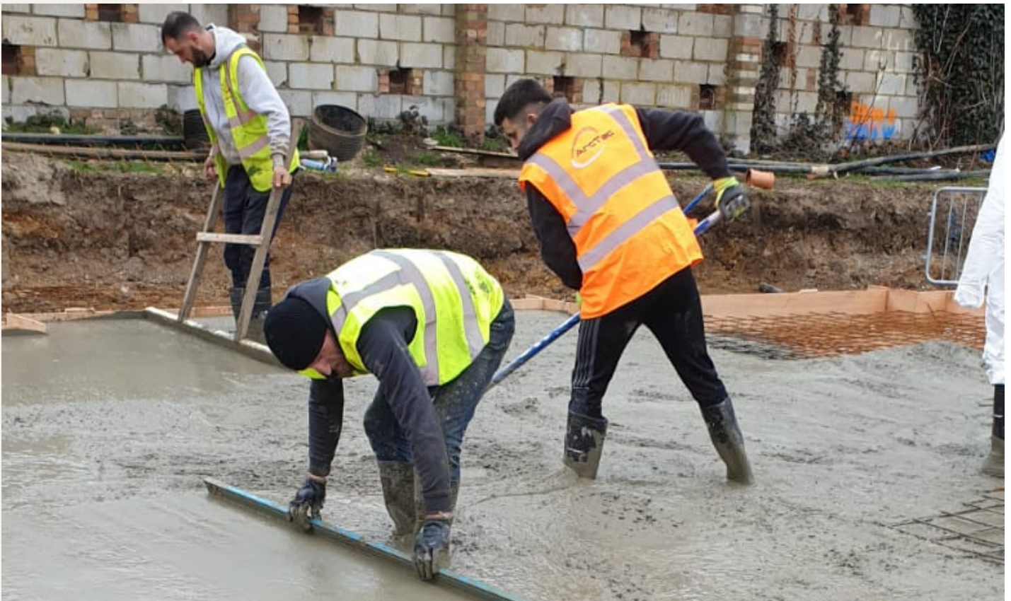
Concrete Pour GF Slab