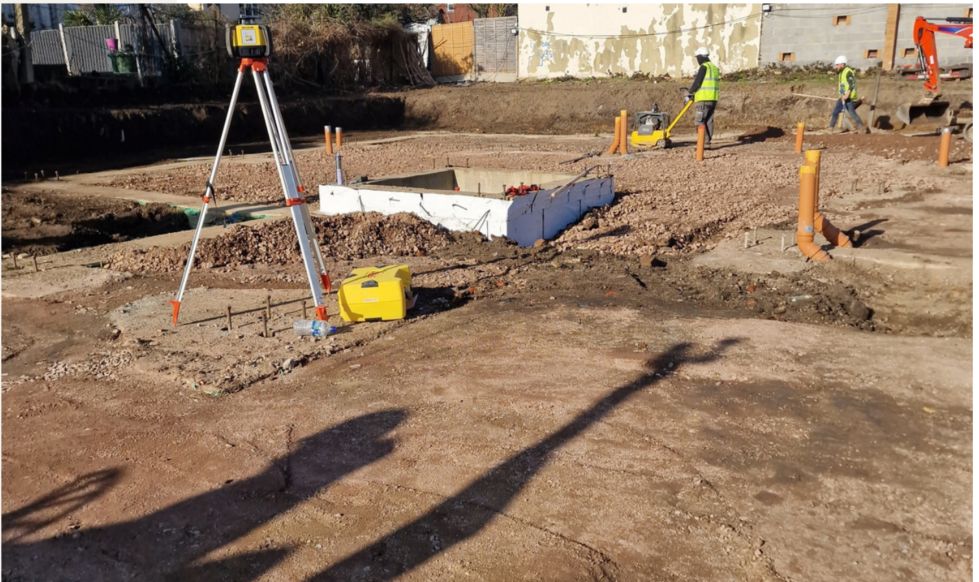
Compacting the sub-base for ground floor slab