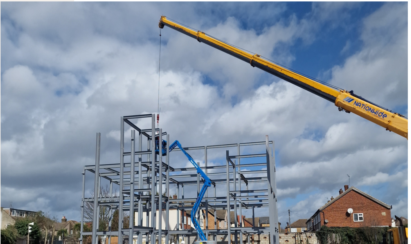
Structural Steel Works