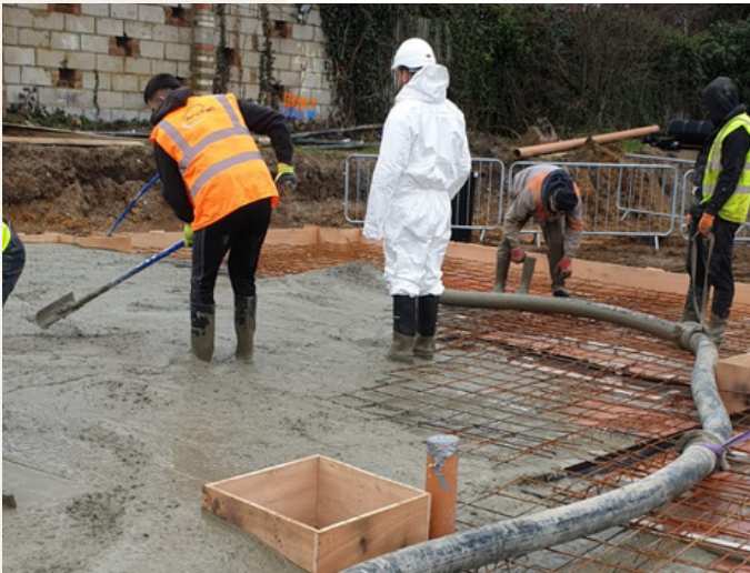
Concrete Pour GF Slab