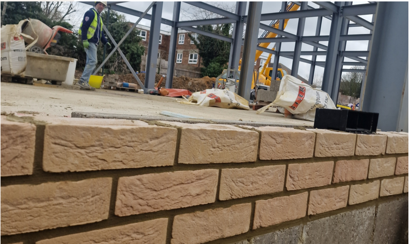
Below DPC Brick Work