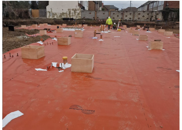
Installation of Gas Membrane