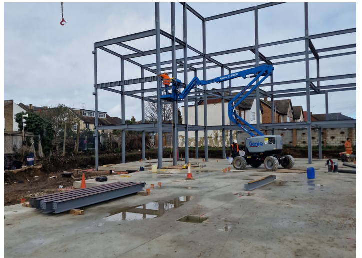
Structural Steel Works