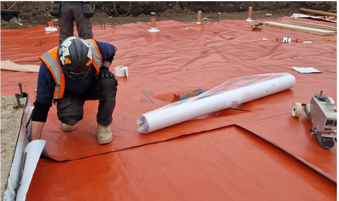
Installation of Gas Membrane