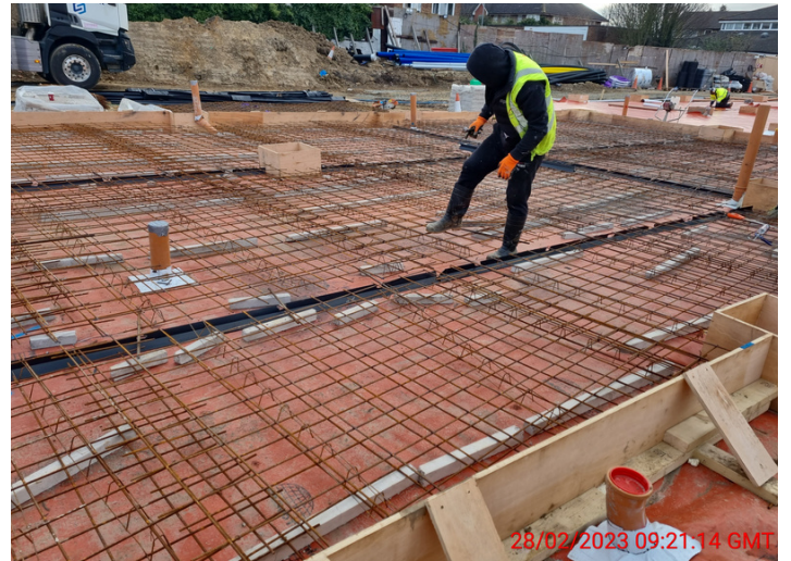
Ground Floor Slab Reinforcement