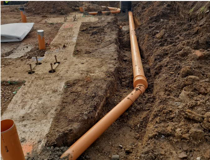
Below Ground Drainage