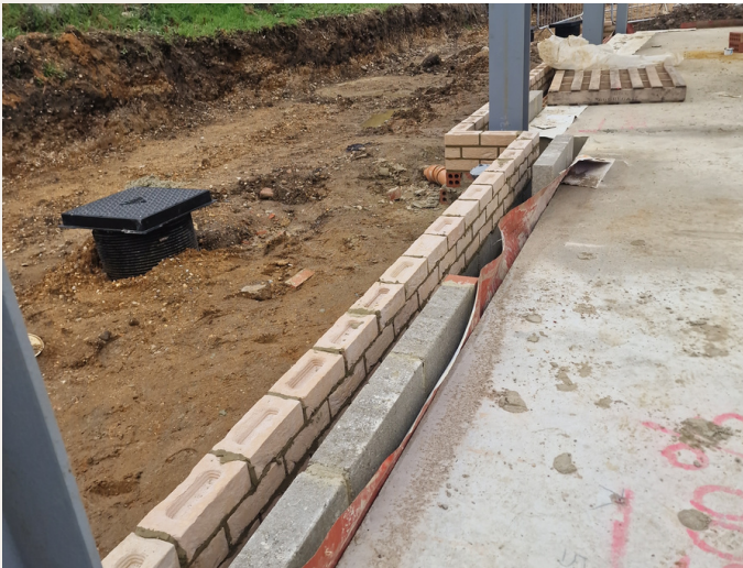
Below DPC Brick Work