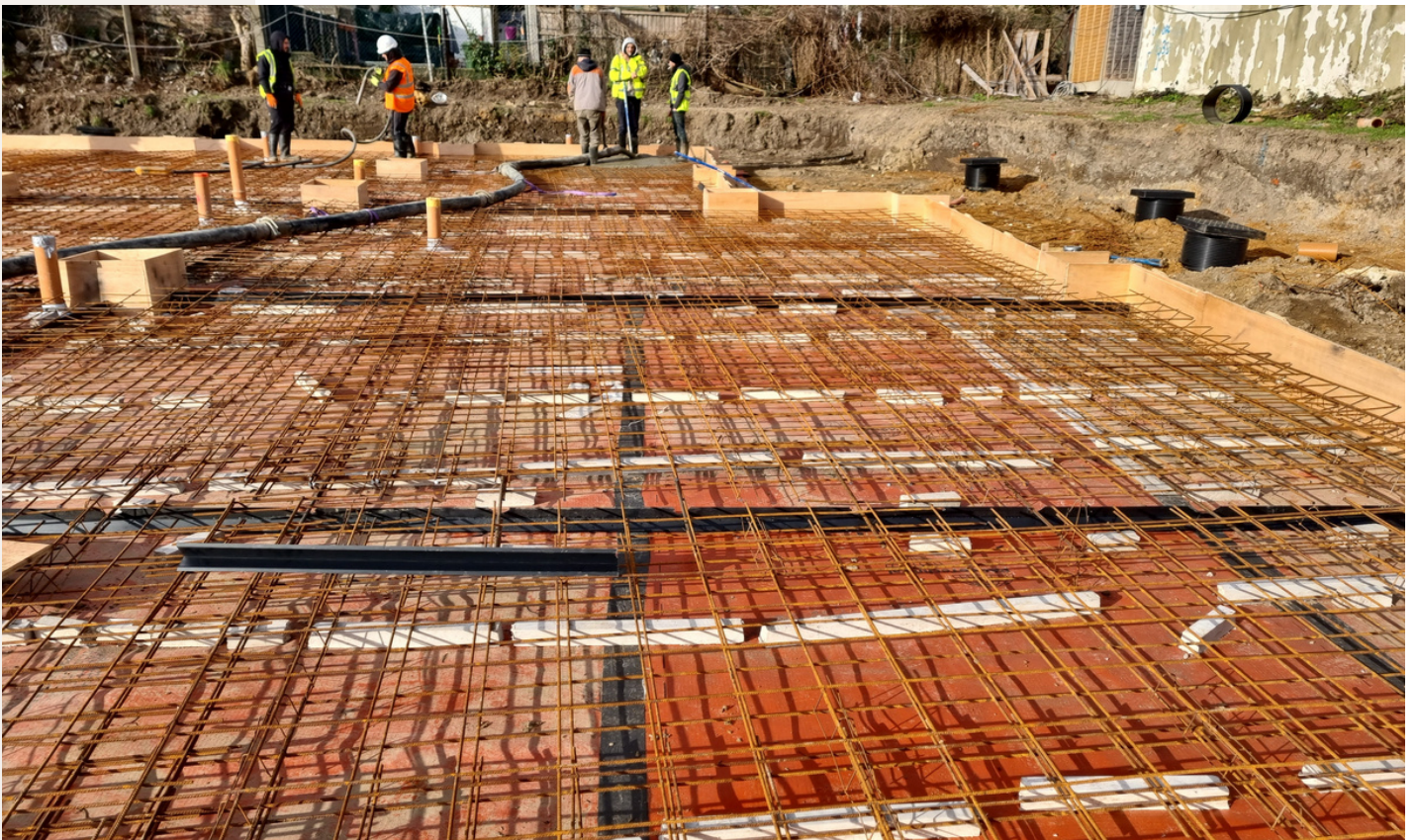
Ground Floor Slab Reinforcement- Expansion joints- Edge Shuttering