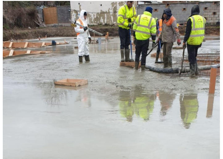
Concrete Pour GF Slab