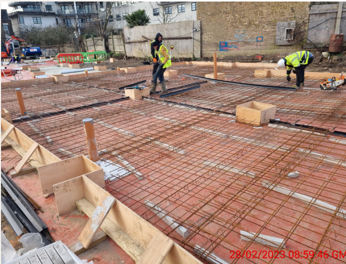
Ground Floor Slab Reinforcement