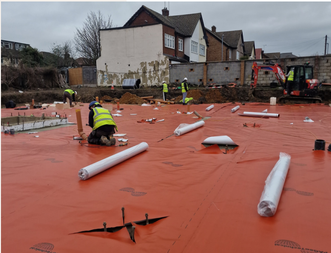
Installation of Gas Membrane