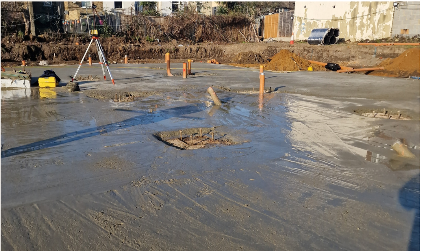
Lean Concrete- Preparation for GF Slab