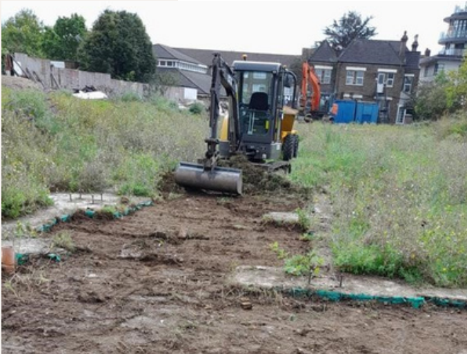
Clearing & Grubbing