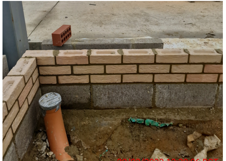
Below DPC Brick Work