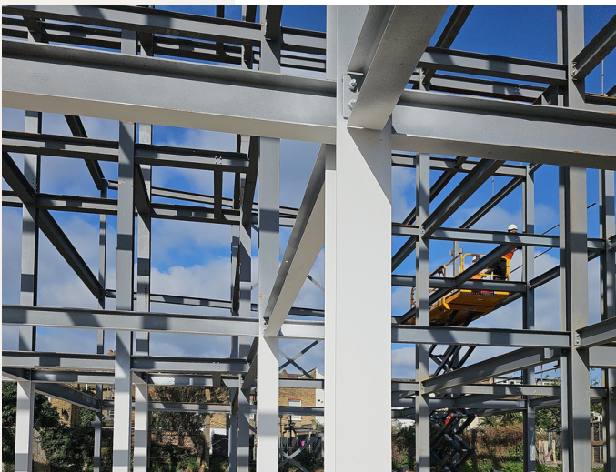
Fire Protection Paint