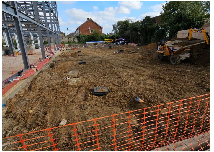
Main Drainage Run