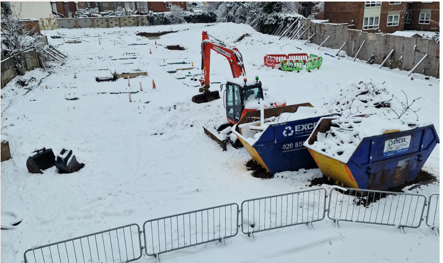
Site Clearing & Grubbing