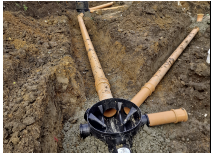
Below Ground Drainage