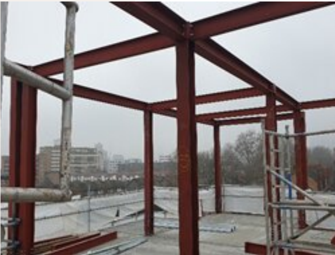
Structural Steel- Columns & Beams