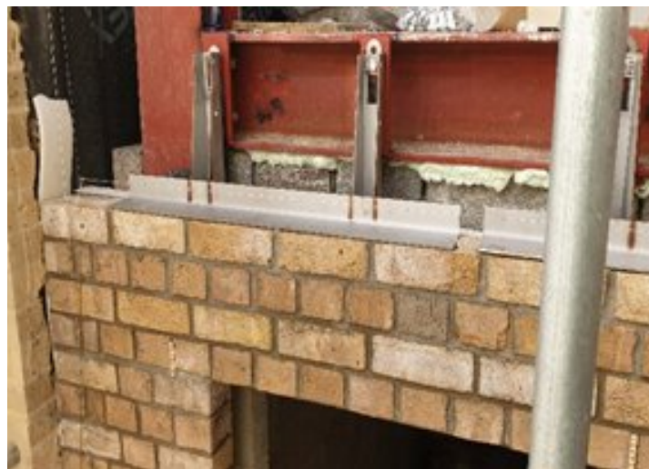
External Cavity Wall Construction