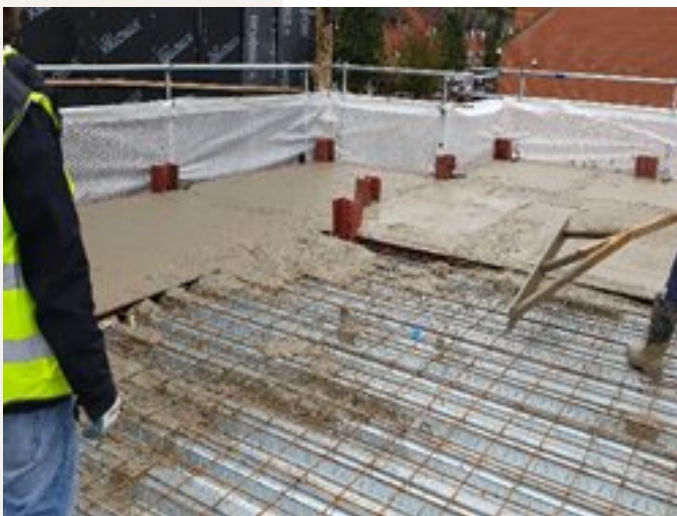
Sub floor- Concrete on Metal Decking