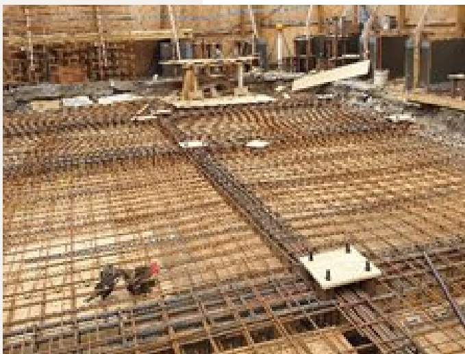
RCC Ground Floor Slab