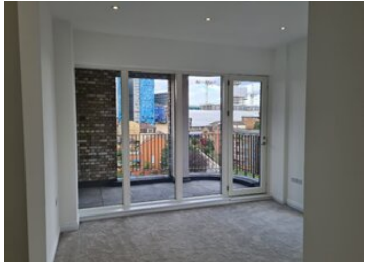
Carpet & Windows