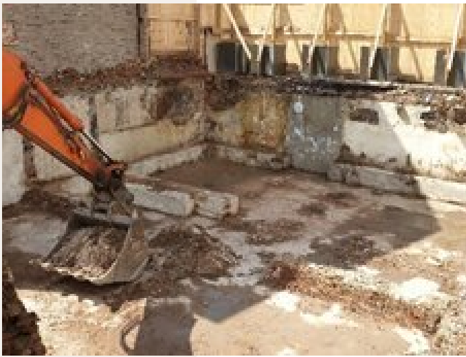
Demolition of Existing Building