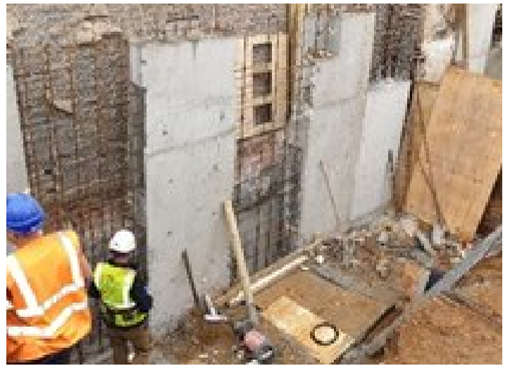
Retaining Walls in Sections