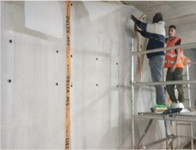
Basement Water Proofing- Delta System