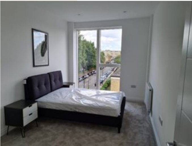
Bed Room- Finished