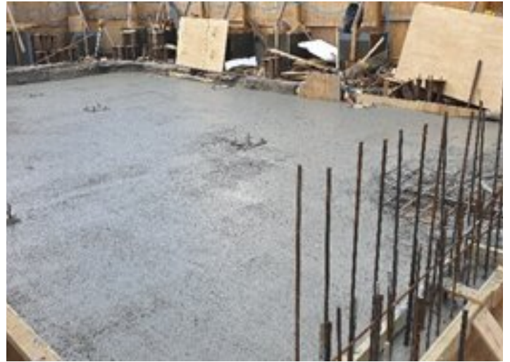
RCC Ground Floor Slab