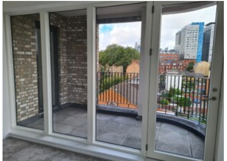
Terrace with Metal Balustrade