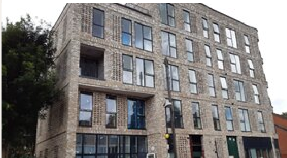
Jubilee Street View