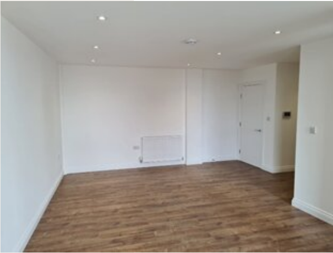
Engineered Timber Flooring