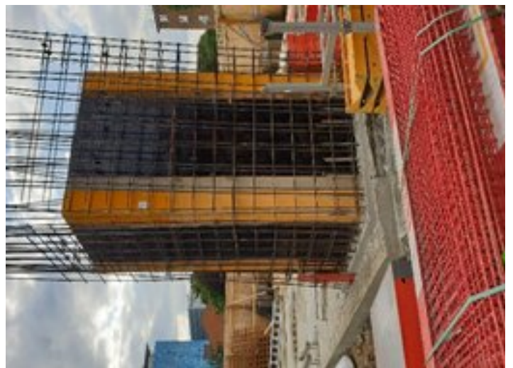
RCC Lift Shaft