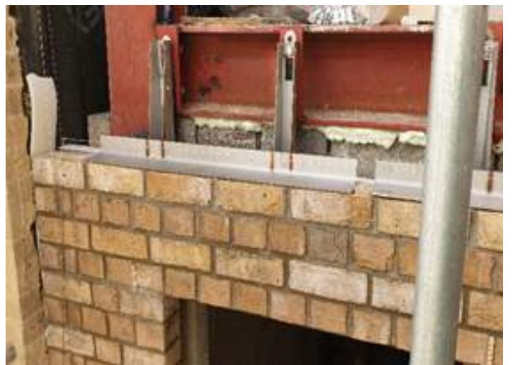
External Cavity Wall Construction