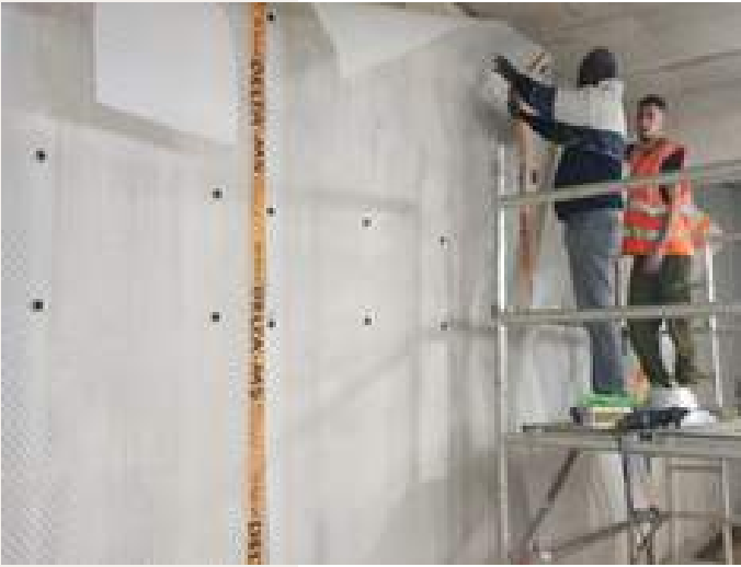
Basement Water Proofing- Delta System