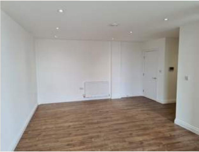
Engineered Timber Flooring