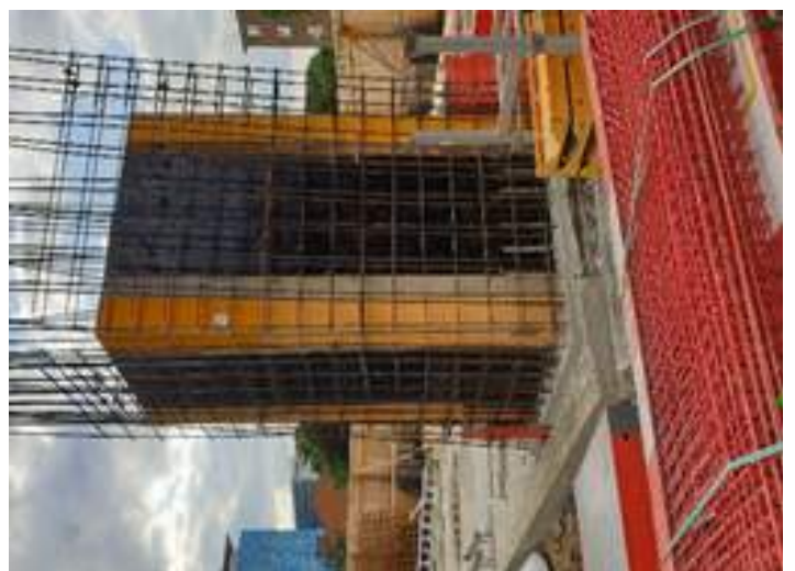
RCC Lift Shaft