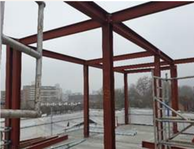
Structural Steel- Columns & Beams