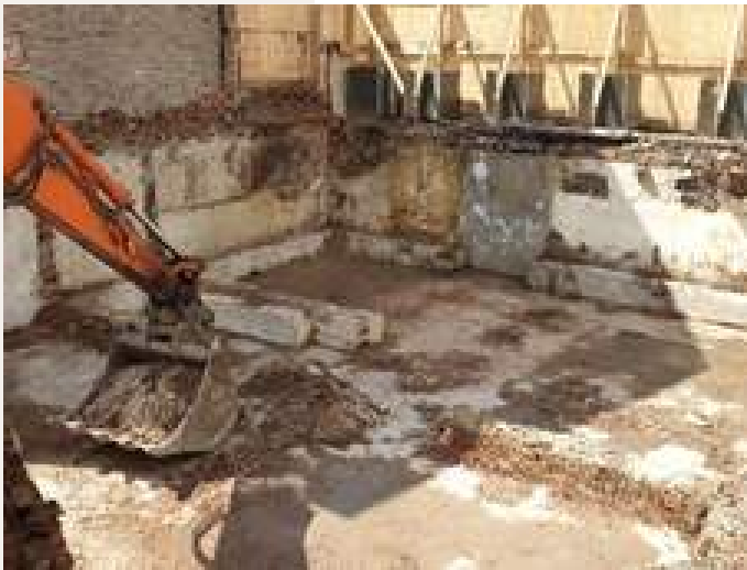
Demolition of Existing Building