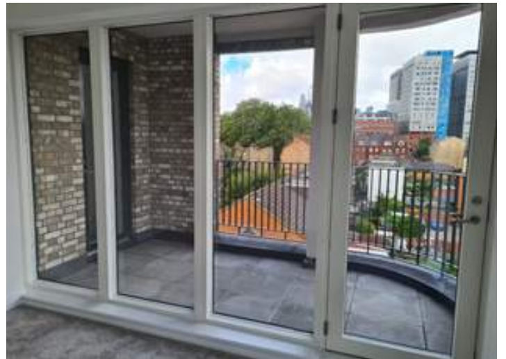
Terrace with Metal Balustrade