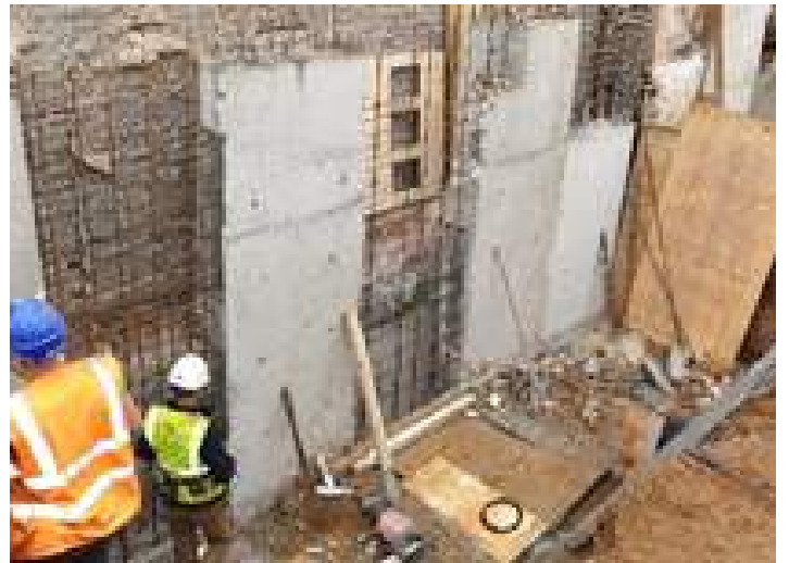
Retaining Walls in Sections