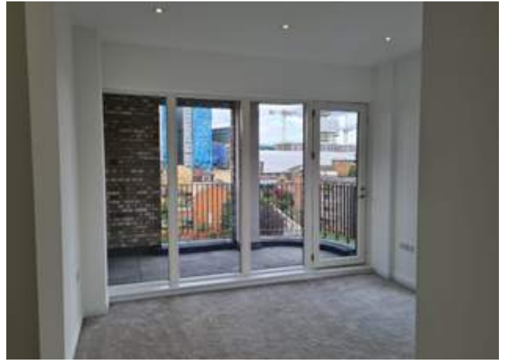
Carpet & Windows