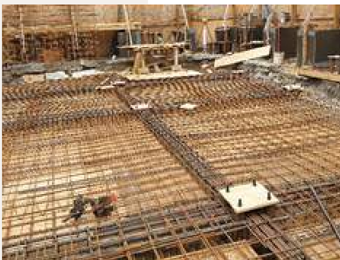
RCC Ground Floor Slab