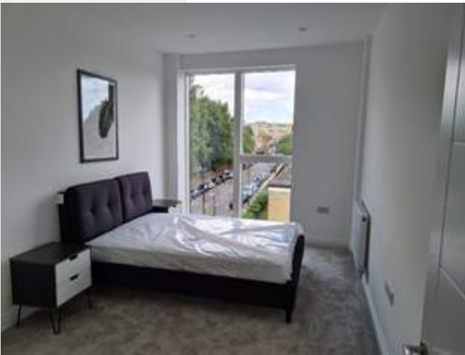
Bed Room- Finished