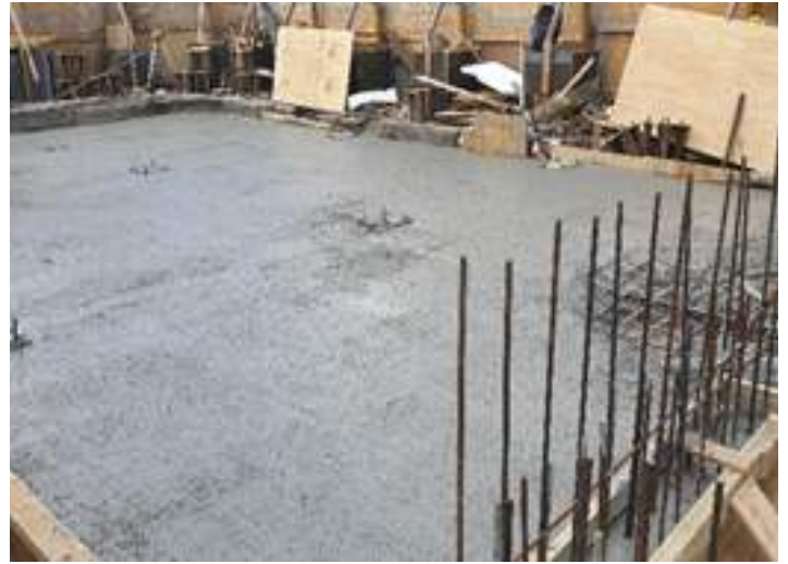
RCC Ground Floor Slab