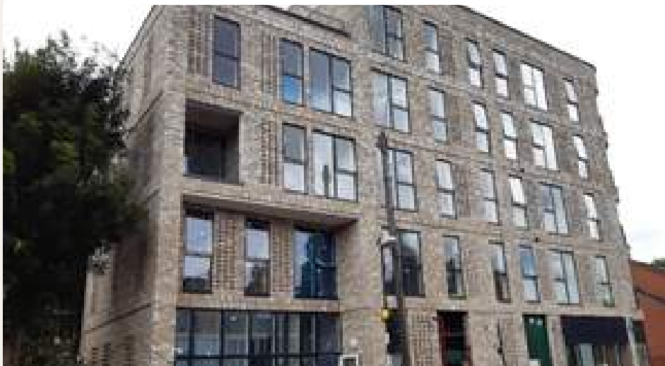
Jubilee Street View