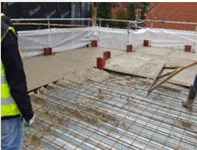
Sub floor- Concrete on Metal Decking