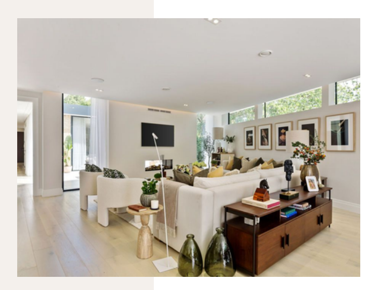
Living Room Finishes