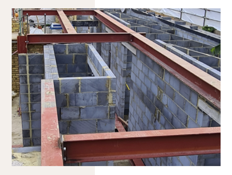
Structural Steel Work