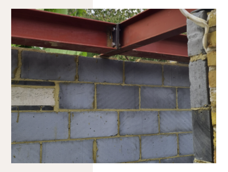
Masonry & Structural Work