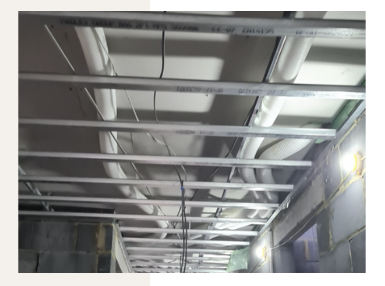
Ceiling & Ventilation Ducts