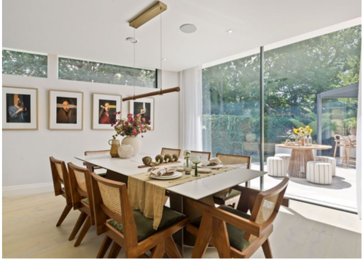
Dinning Room- Finishes