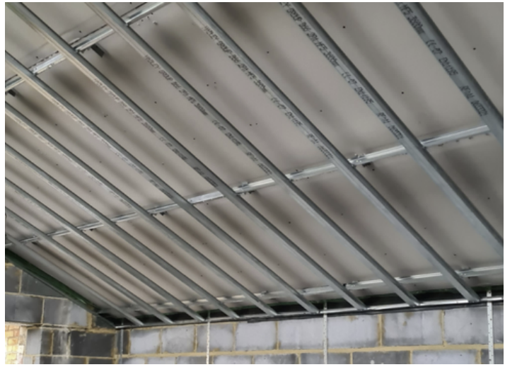
Metal Stud-Ceiling Work