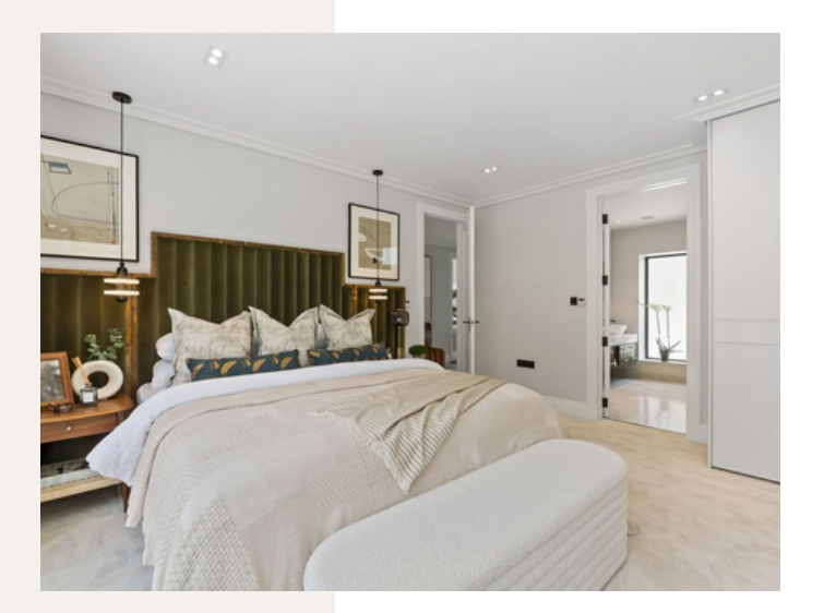
Bed Room Finishies