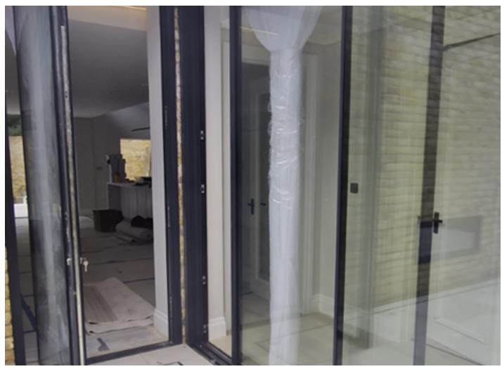
Aluminium Windows Installation