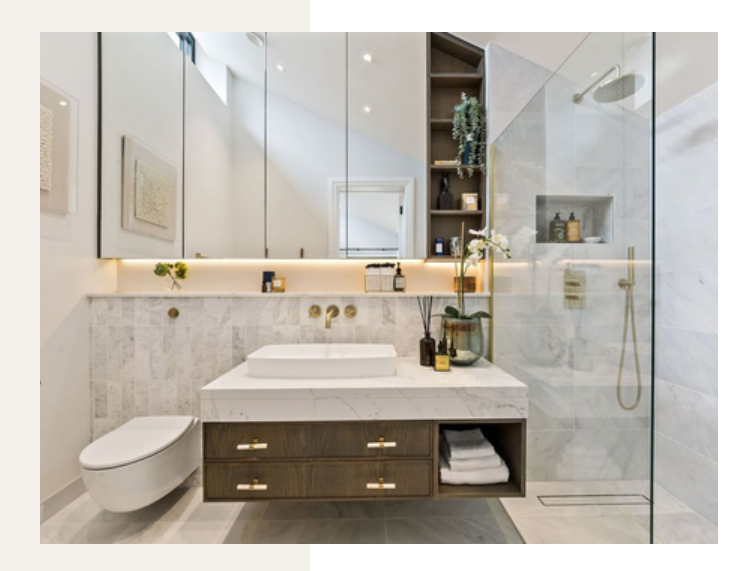
Shower Room Finishes