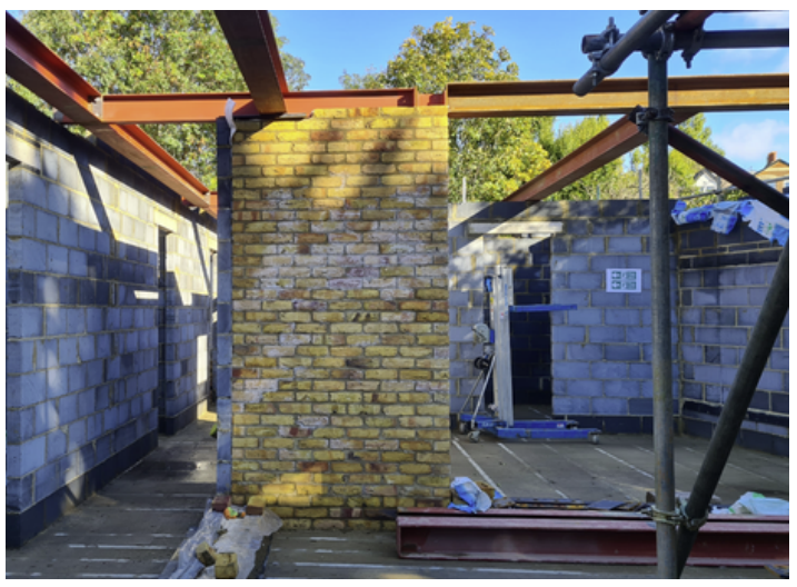
Structural Steel Work