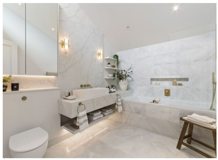
Bath Room Finishes