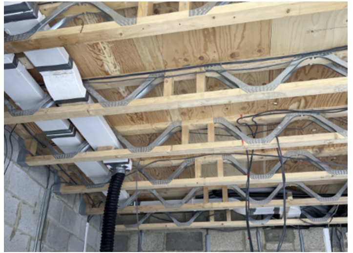
Posi Joists Floor/Roof