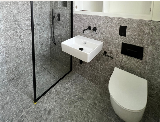
Walk in Showers