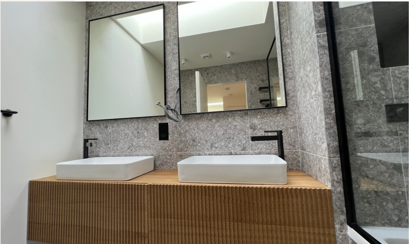
Finish Bath Room