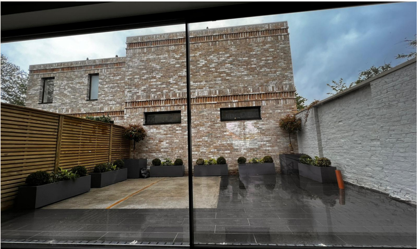
Metal Stud Partitioning