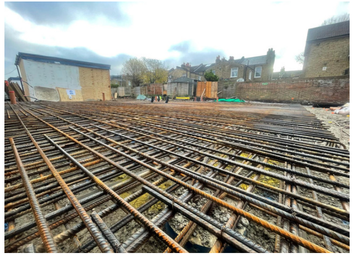
Ground Floor Slab Rebars