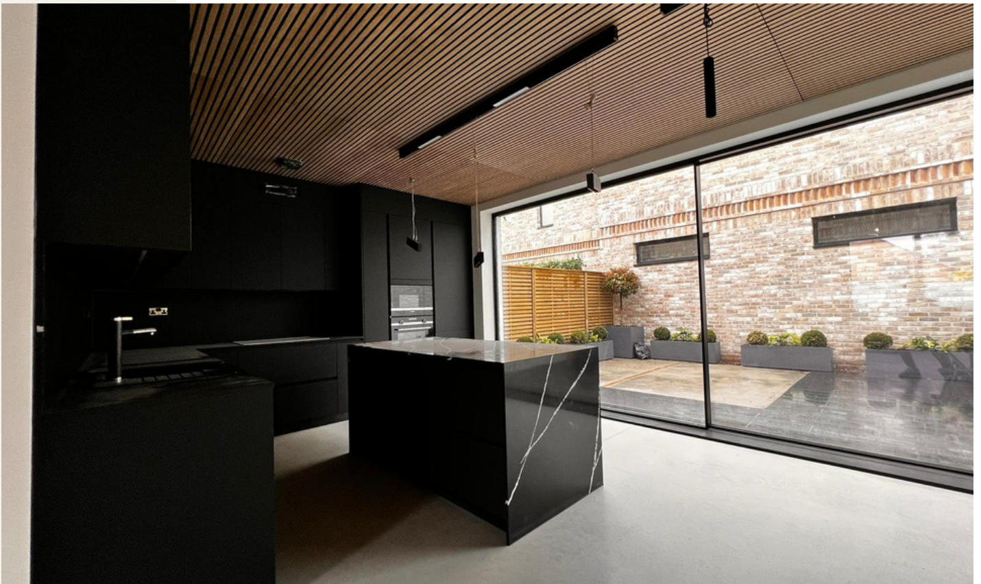
Polished Concrete & Large Frame Patio Doors