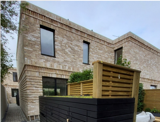
Under Floor Heating