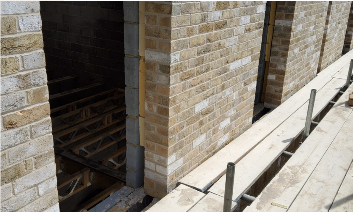
Brick & Block External Walls