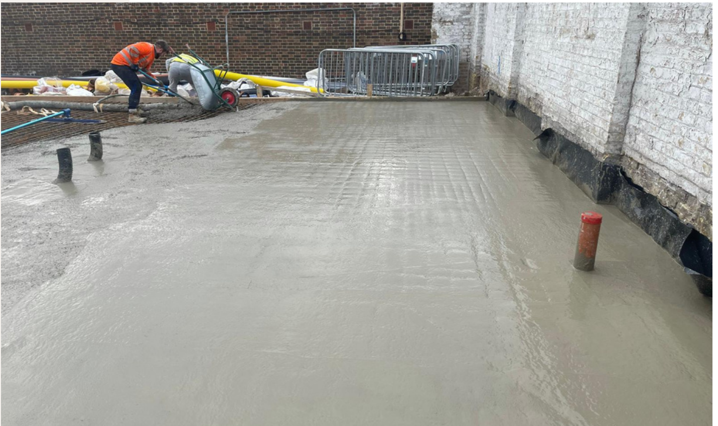
Ground Floor Slab- Concrete