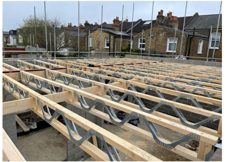
Posi Joists Floor/Roof