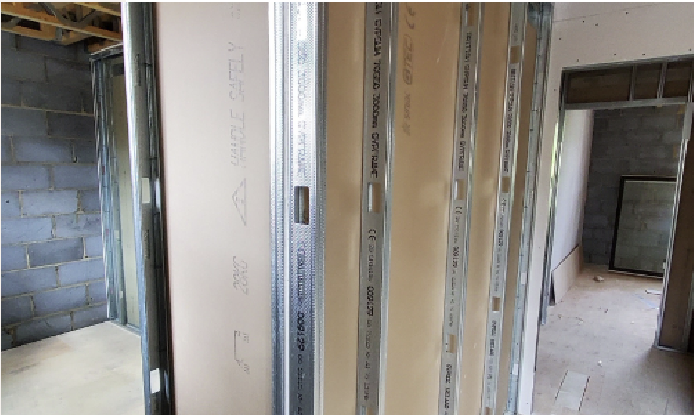
Metal Stud Partitioning