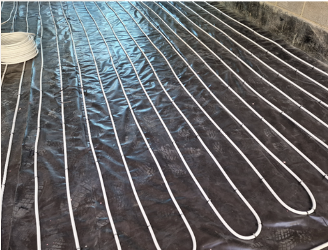
Under Floor Heating