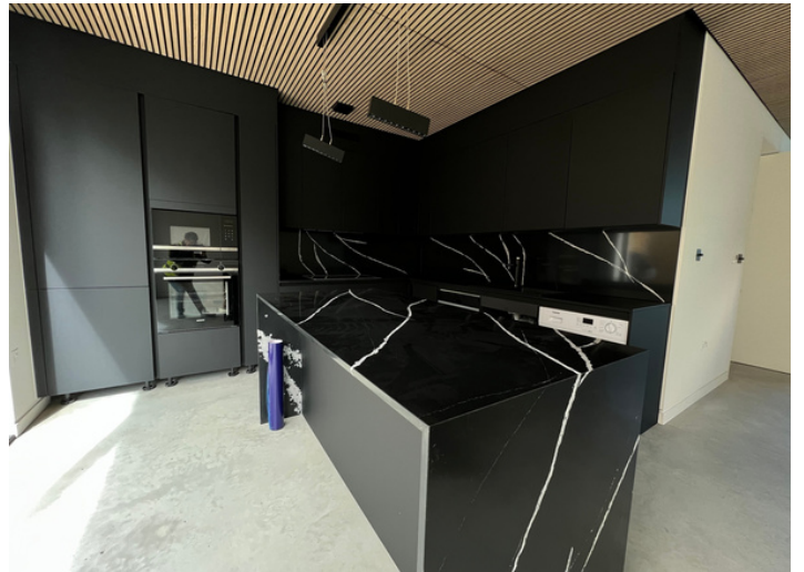
High Spec Kitchen- Granite Worktop